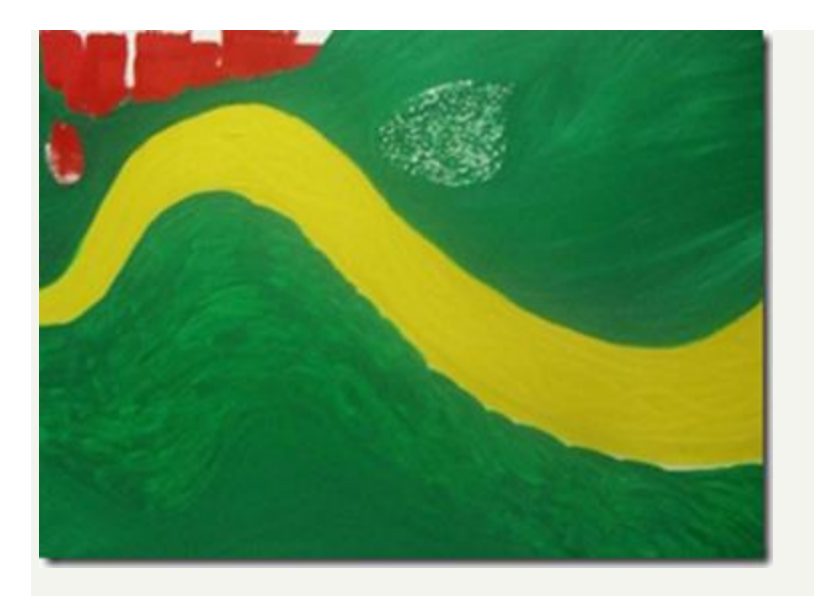
Saraswati Flows, Oil On Canvas Dimensions: 48 x 36 inches by Prakash Bal Joshi